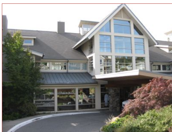
The Chrysalis Inn & Spa

Having just checked into The Chrysalis Inn and Spa and enjoyed a tour of this delightful property with 48 rooms, we took off for an early evening out. Our goal for this trip was to discover Bellingham, WA and all it has to offer. We could not have asked for a better start. We pulled into Taylor Shellfish Farms (the largest in the U.S.), for a seafood demo and scrumptious dinner. The catch was, we had to work a little for it.